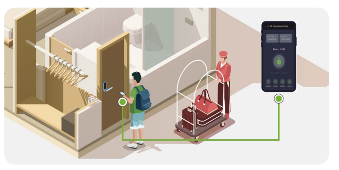
Mobile Credential Unlock simply with a smartphone HTML5 (H5)