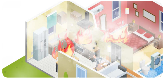
Free Egress The lock can always be opened from the inside