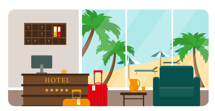
Flexible Scenarios 96H salt spray test for humid environment