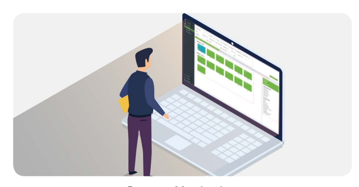
Remote Monitoring Monitor doors' status in real-time from anywhere